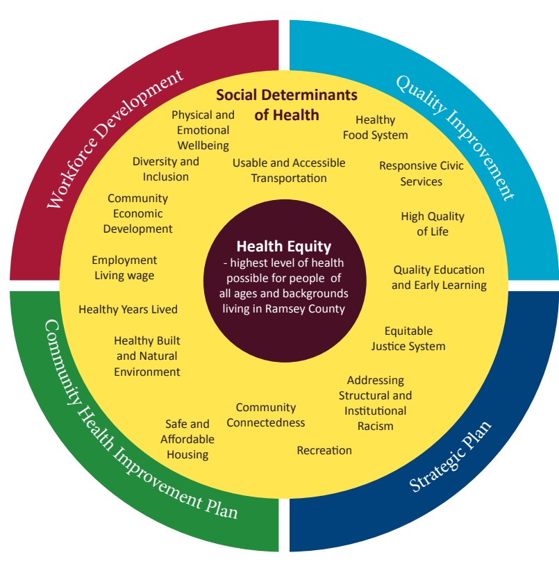
Framework for Health Equity Social Determinants of Health and Health in All Policies